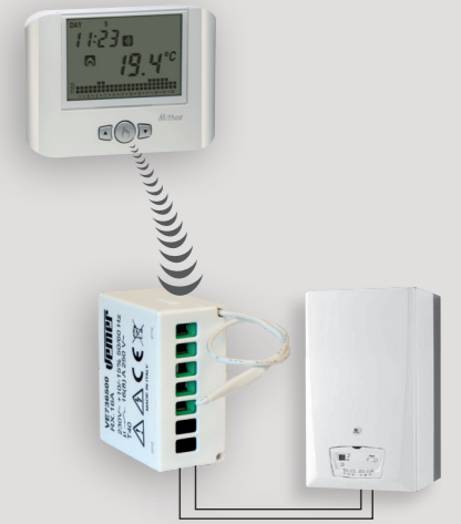
Example of connection with 1 channel remote actuator