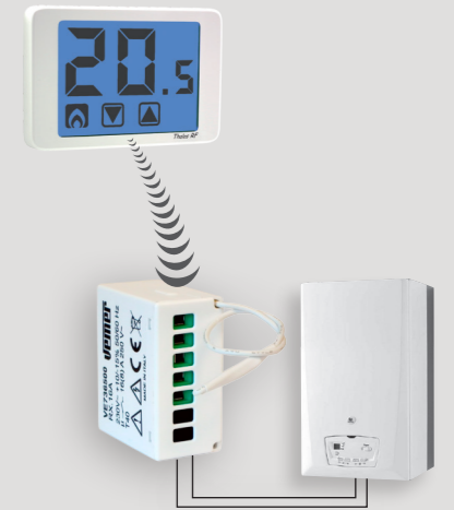
Example of connection with 1 channel remote actuator