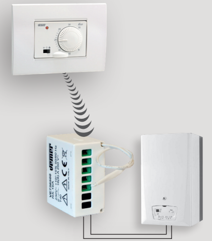
Example of connection with 1 channel remote actuator